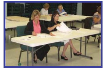
Staff members hand count ballots at the post election audit.

Pursuant to Florida Statutes 101.591, the post election audit for Municipal Elections took place on Friday, April 17, 2009. Ballots from all precincts were hand counted by election staff. The result of the hand count when compared with the Optical Scan system revealed a 100% accuracy rate. For more detailed information on this audit, see this link on our website: www.pascovotes.com/pdf/09MunResults.pdf .